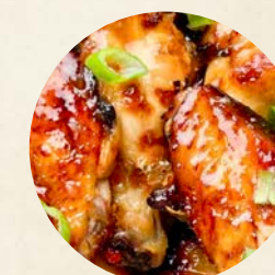
Sweet Red Chilli